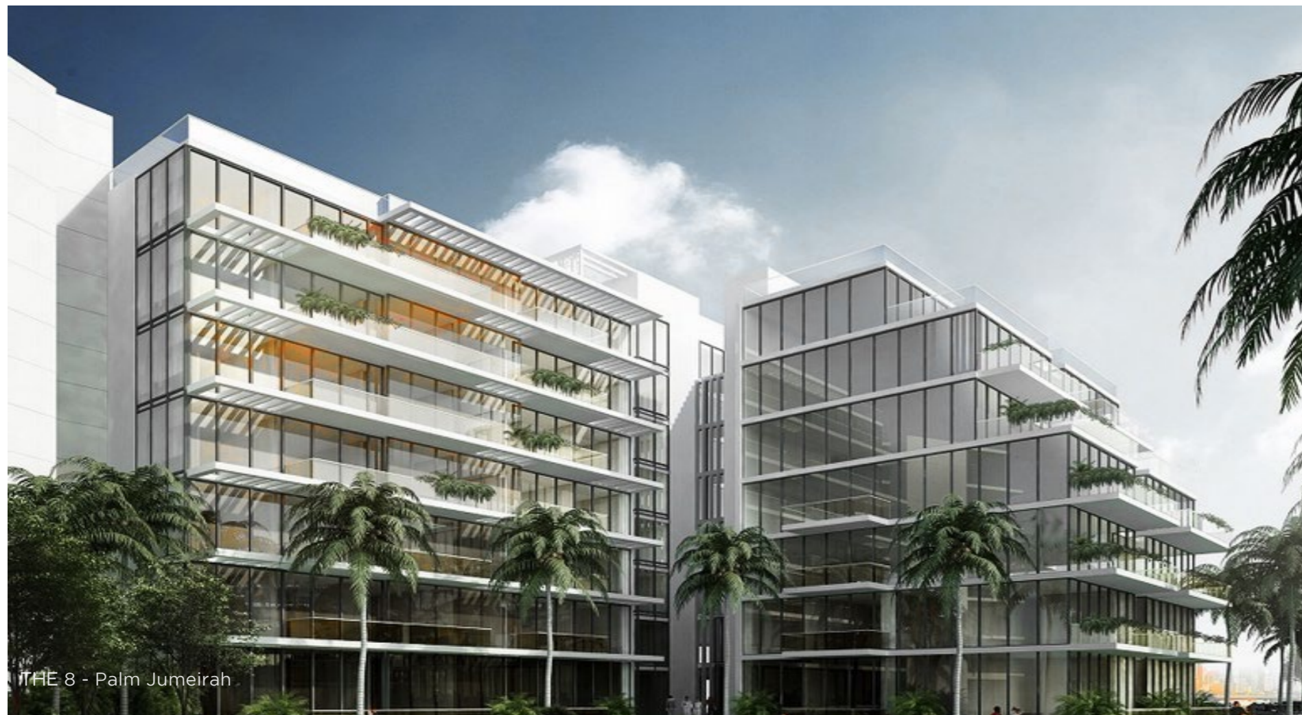
THE 8 - Palm Jumeirah